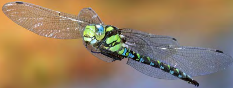
southern hawker dragonfly