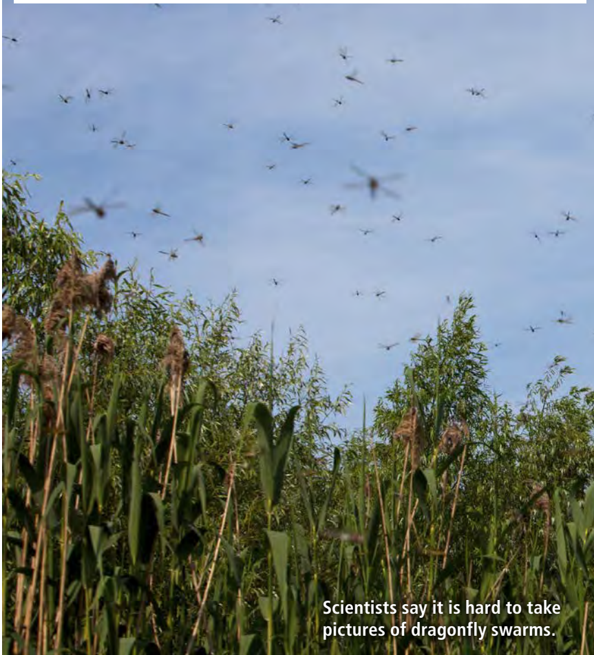
Scientists say it is hard to take pictures of dragonfly swarms.

Dragonflies sometimes travel in huge groups, called swarms . They travel in swarms for food and to go south for the winter.