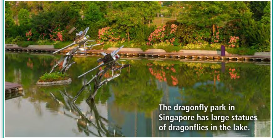
The dragonfly park in Singapore has large statues of dragonflies in the lake.

In 1985, people in Japan created the world's first dragonfly park. Today there are also dragonfly parks in Europe and the United States. Dragonflies are amazing creatures—and people all over the world are starting to realize it!