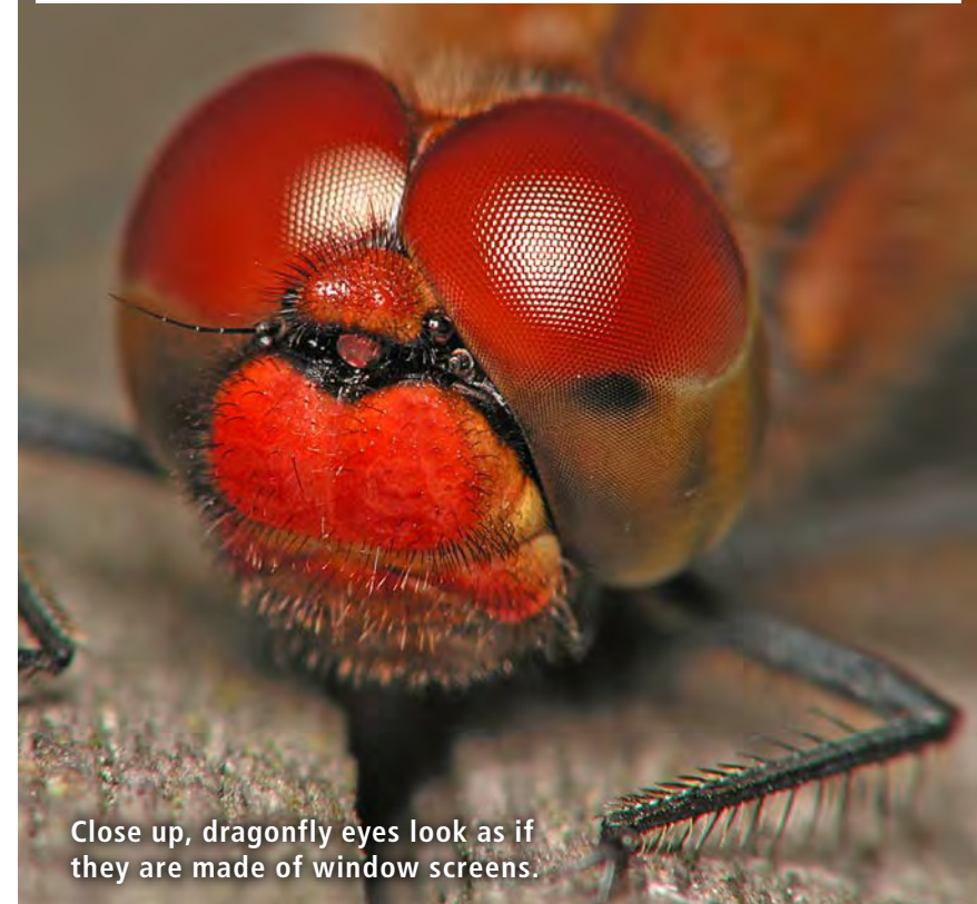
Close up, dragonfly eyes look as if they are made of window screens.

Adult dragonflies have the largest eyes of any kind of insect. Each eye is made up of about thirty thousand tiny pieces. They can see in almost all directions at once. Dragonflies' super eyesight helps them catch prey.