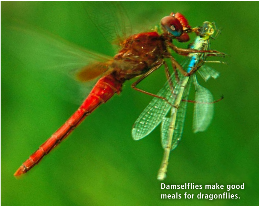
Damselflies make good meals for dragonflies.