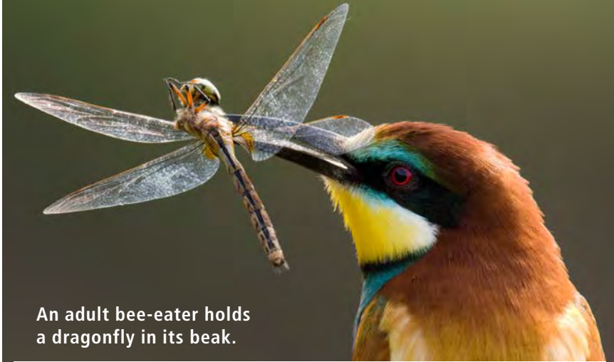
An adult bee-eater holds a dragonfly in its beak.