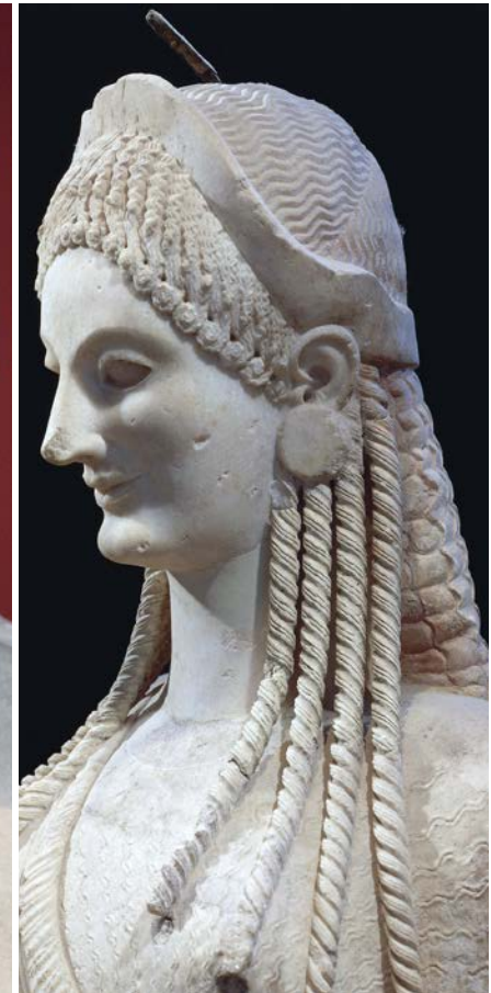
The hairstyles of Greek goddesses, such as Aphrodite (left), may have influenced the elaborate wigs of Greek women of the times (right).