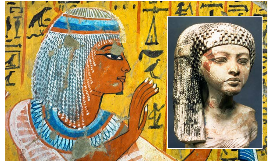
Intricate wigs are depicted in both ancient Egyptian tomb art and sculpture.