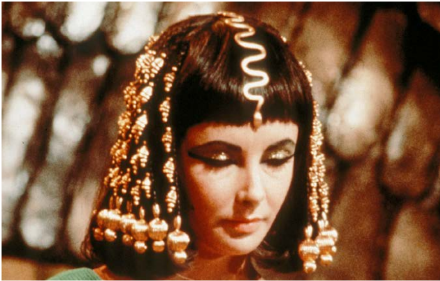
In the film Cleopatra , Elizabeth Taylor had many different hairstyles, each requiring three wigs.

In Egypt, people at every level of society wore wigs. The king and his family wore wigs made of human hair and decorated with ivory and silver ornaments. They had hairstylists who maintained their wigs. The wealthy classes could afford wigs made from wool or goat hair, while poor people could only afford straw wigs.