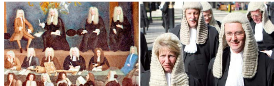
Then and now: (left) a depiction of the English court in the eighteenth century; (right) judges attending a meeting at Westminster Abbey

By the eighteenth century, wigs were used by almost everyone in Western Europe—at least everyone who was involved with the royal courts and certain professions. Wigs became an integral part of a uniform signifying that the wearer was a doctor, barrister (lawyer), judge, or a member of the clergy or nobility. The wigs were often made from horsehair, which was stiff and thick but was also cheaper than human hair. Even when large, curled, powdered wigs fell out of fashion, people in these professions continued to wear them in public. To this day, judges and barristers in the United Kingdom court system wear wigs as part of their uniforms.